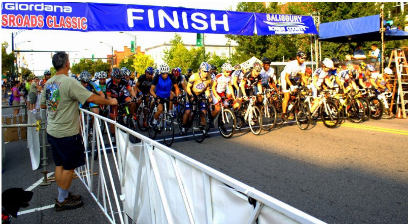
Salisbury Bike Race

The Cabarrus-Rowan MPO has an active membership and transportation planning process from project planning to programming to implementation to preservation. MPO members have taken ownership in the development of the transportation system. The 2045 MTP serves as the pathway for developing and managing this transportation system over the next 25 years.